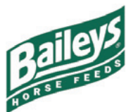
Baileys Horse Feeds